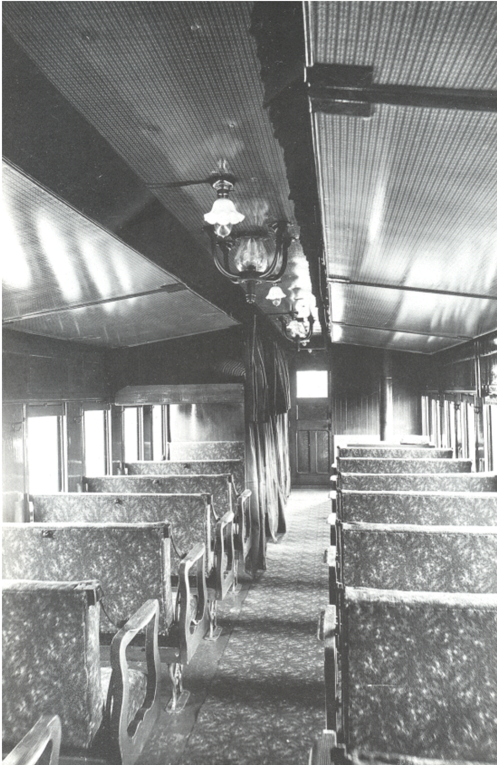
1864 Interior of Pullman's First Sleeping Car